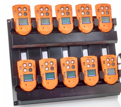
10 way charger For charging and storing your T4 fleet