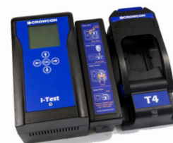
I-Test Easy automated bump testing and calibration solution