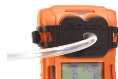
Bump/calibration plate To apply test gas to T4