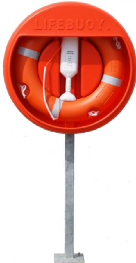
Shown with optional galvanised post