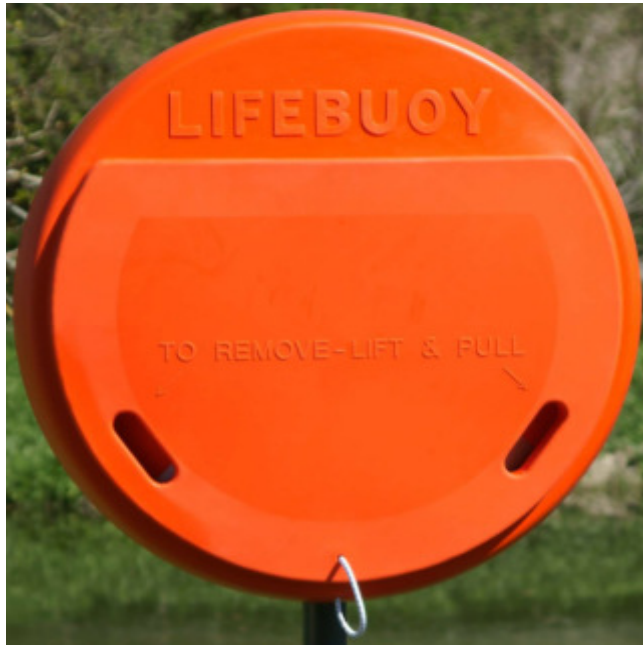
Shown with optional clip in front cover fitted