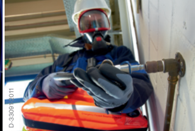
Dräger Saver PP soft bag