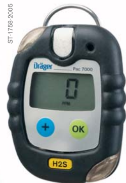
Dräger Pac 7000 Increased functionality and no lifetime limitation.

Visual, vibrating and audible alarms are