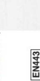
MSA GALLET communication systems