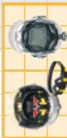
Ratchet system with quick size adjustment