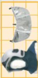
Standard net cradle