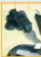
Connection kit for fire masks