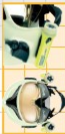
Both sides integrated lamp supports