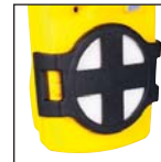
Auxillary filter kit