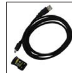
IR connectivity kit