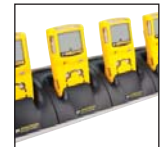
Five unit cradle charger

For a complete list of accessories, please contact BW Technologies by Honeywell.