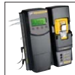
MicroDock II compatible