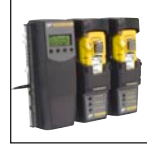
MicroDock II compatible